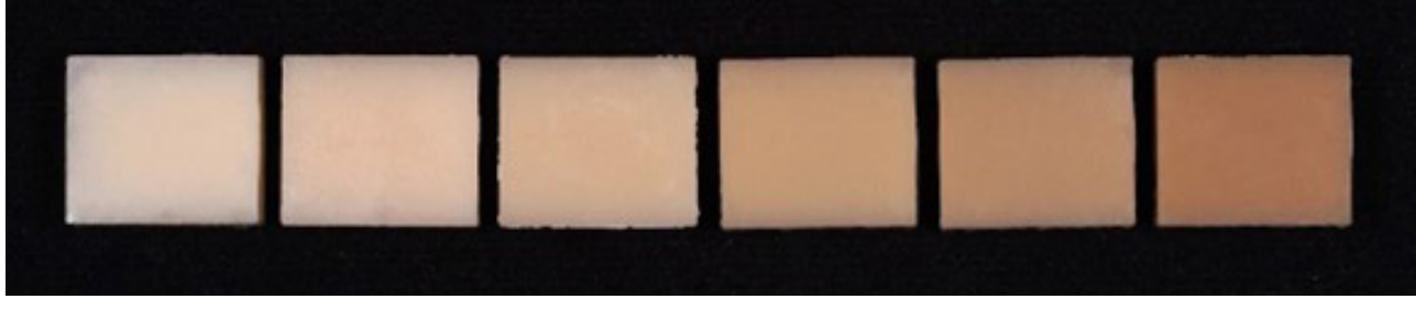
Figure 1 Different background colors from left to right: 1M1 (reference), 1M2, 2M2, 3M2, 4M2, and 5M2

a light-curing composite material for extraoral application (Vita VM LC Base Dentine, Vita Zahnfabrik, Germany) in shades 1M1, 1M2, 2M2, 3M2, 4M2, and 5M2 was used to fabricate background specimens. The 4 mm thick, rectangular-shaped backgrounds were fabricated using a mold, and polymerized by a light curing unit (Solidilite V, Shofu Dental, USA) according to the manufacturer's instructions. The 1M1 shade was used as a reference background (Fig. 1).