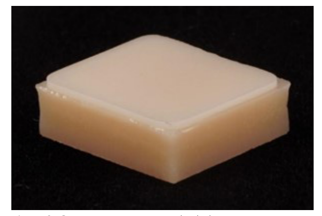
Figure 2 Ceramic specimen over shaded resin composite background

positioned over black and white backgrounds. Greater TP_m values meant higher translucency of the materials.