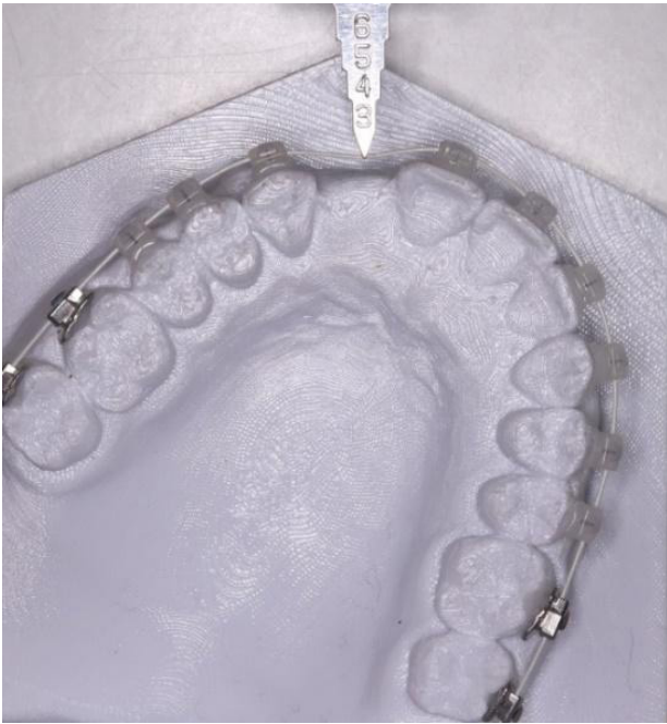
Figure 1 Demonstration of the indenter positioned in the middle of the unsupported wire between maxillary central incisor and canine during the experiment.