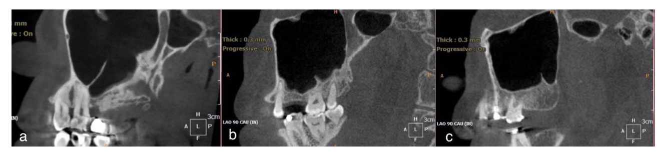
Figure 3 Locations of septa: (a) A sagittal CBCT image showed an example of sinus septa in the anterior region in the left maxillary sinus. (b) A sagittal CBCT image showed an example of sinus septa in the middle region in the left maxillary sinus. (c) A sagittal CBCT image showed an example of sinus septa in the posterior region in the left maxillary sinus