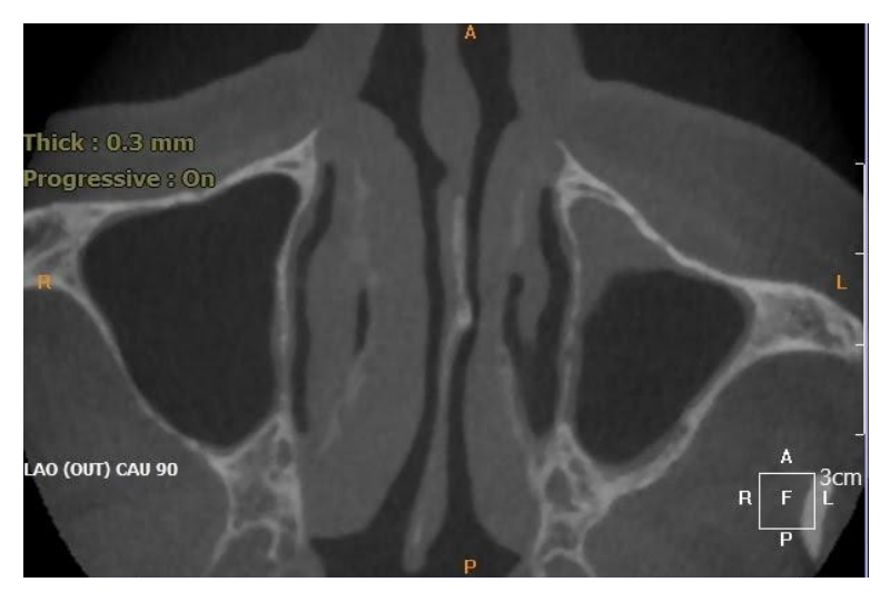
Figure 1 An axial CBCT image showed an example of a non-investigated left sinus due to pathology

All CBCT images were viewed and evaluated on the picture archiving and communication system (PACS) software (Infinitt<sup>®</sup> software, Infinitt Healthcare Co. Ltd., Seoul, Korea). The parameters regarding patient's data (age, sex, status of dentition of the investigated side: dentate, partial edentulous, edentulous), maxillary sinus septum of more than 2.5 mm in height, type of septa (sagittal, coronal, axial, others) (Fig. 2), the maxillary sinus wall that the septum originated from (floor, roof, medial, lateral, anterior, posterior), the number of septa in the sinus, the location of the septa (anterior: premolar, middle: first and second molar, posterior: third molar) (Fig. 3) and the completion of the sinus (complete: cross one wall to the opposing wall, incomplete) were reviewed from the software by two observers. Prior to the observation, a calibration session to be familiar with the software and the collecting data was performed. Twenty percent of the included CBCT scans were randomly re-evaluated after four weeks.