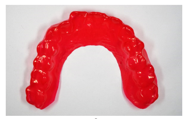
Figure 1 Finished Brux Checker®

occlusal splint to confirm being the true bruxer. Then the alginate impression was taken to fabricate a dental model with dental stone. The dental model was then sent to a laboratory to construct the Brux Checker<sup>®</sup> from the polyvinyl chloride plate using vacuum pressure machine (Bio Star<sup>®</sup>). (Fig. 1) Brux Checker<sup>®</sup> was given to the participant for familiarity and observation of allergic reactions to polyvinyl chloride and acid red 51 food coloring for ten minutes. (Fig. 2) Then the participant was instructed to wear Brux Checker<sup>®</sup> at bedtime and observe for the number of nights when the wear marks on Brux Checker<sup>®</sup> first appeared. Once the recording was completed, the participant inserted the Brux Checker<sup>®</sup> on the dental model or in the box to prevent tearing and sent it back to the researcher. (Fig. 3)