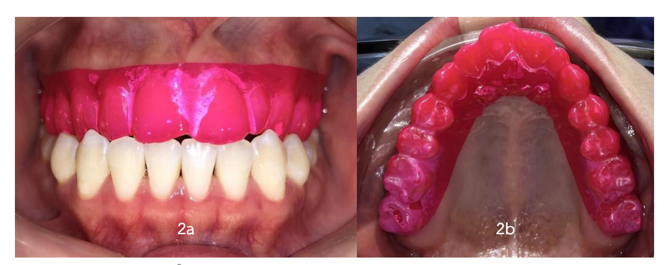
Figure 2 Wearing a Brux Checker<sup>®</sup> in the subject; 2a in frontal view, 2b in occlusal view