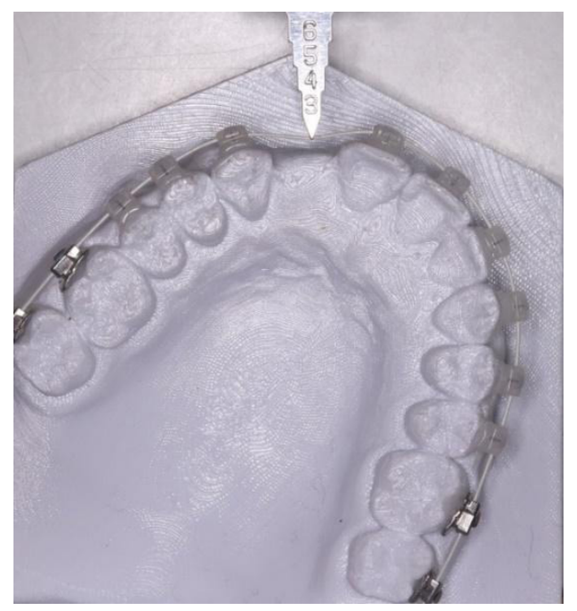
Figure 1 Demonstration of the indenter positioned in the middle of the unsupported wire between maxillary central incisor and canine during the experiment.