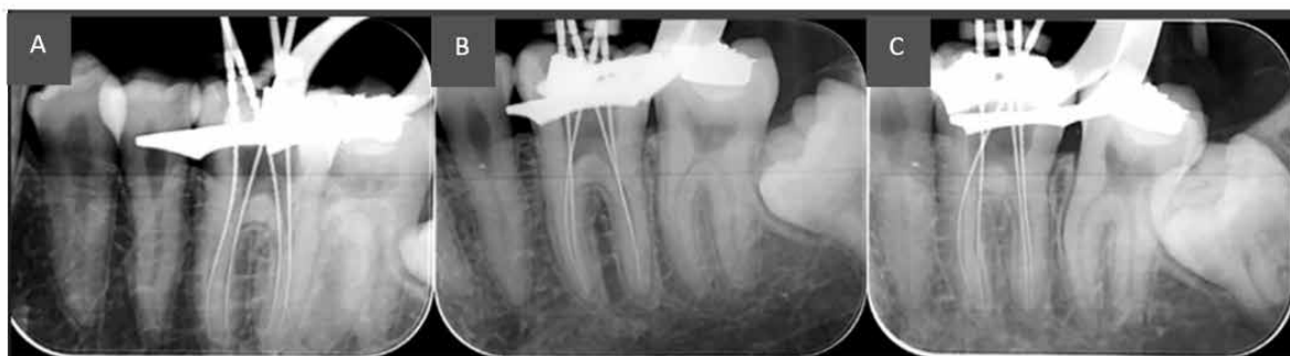
Figure 2 Representative acceptable and unacceptable radiographic images. Working length determination radiographs of a first mandibular molar (4 canals) taken at different angulations: A = +20°, B = 0°, C = -20°. Score = 1 (A and C), score = 0 (B).

1 = Acceptable (distinct separation of all superimposed root canals)