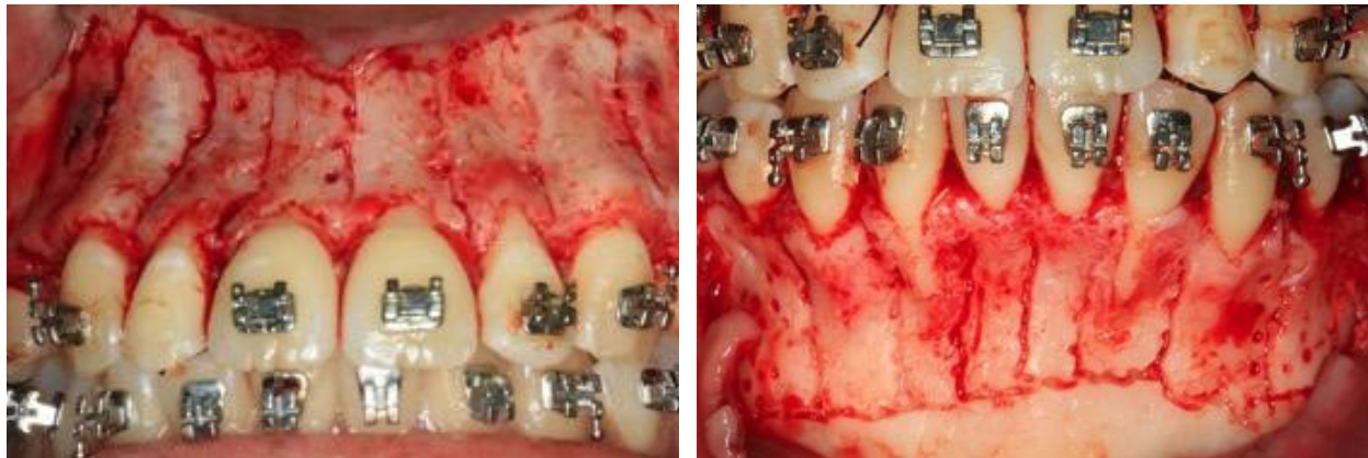
Figure 1 Corticotomy in area of anterior teeth in bimaxillary protrusion patient.

The indications of a corticotomy in bimaxillary protrusion can be concluded as follows: