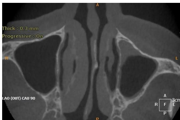
Figure 1 An axial CBCT image showed an example of a non-investigated left sinus due to pathology

All CBCT images were viewed and evaluated on the picture archiving and communication system (PACS) software (Infinitt® software, Infinitt Healthcare Co. Ltd., Seoul, Korea). The parameters regarding patient's data (age, sex, status of dentition of the investigated side: dentate, partial edentulous, edentulous), maxillary sinus septum of more than 2.5 mm in height, type of septa (sagittal, coronal, axial, others) (Fig. 2), the maxillary sinus wall that the septum originated from (floor, roof, medial, lateral, anterior, posterior), the number of septa in the sinus, the location of the septa (anterior: premolar, middle: first and second molar, posterior: third molar) (Fig. 3) and the completion of the sinus (complete: cross one wall to the opposing wall, incomplete) were reviewed from the software by two observers. Prior to the observation, a calibration session to be familiar with the software and the collecting data was performed. Twenty percent of the included CBCT scans were randomly re-evaluated after four weeks.