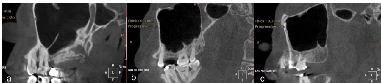
Figure 3 Locations of septa: (a) A sagittal CBCT image showed an example of sinus septa in the anterior region in the left maxillary sinus. (b) A sagittal CBCT image showed an example of sinus septa in the middle region in the left maxillary sinus. (c) A sagittal CBCT image showed an example of sinus septa in the posterior region in the left maxillary sinus